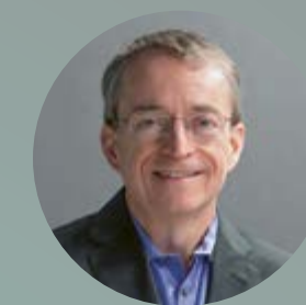
Pat Gelsinger CEO Intel